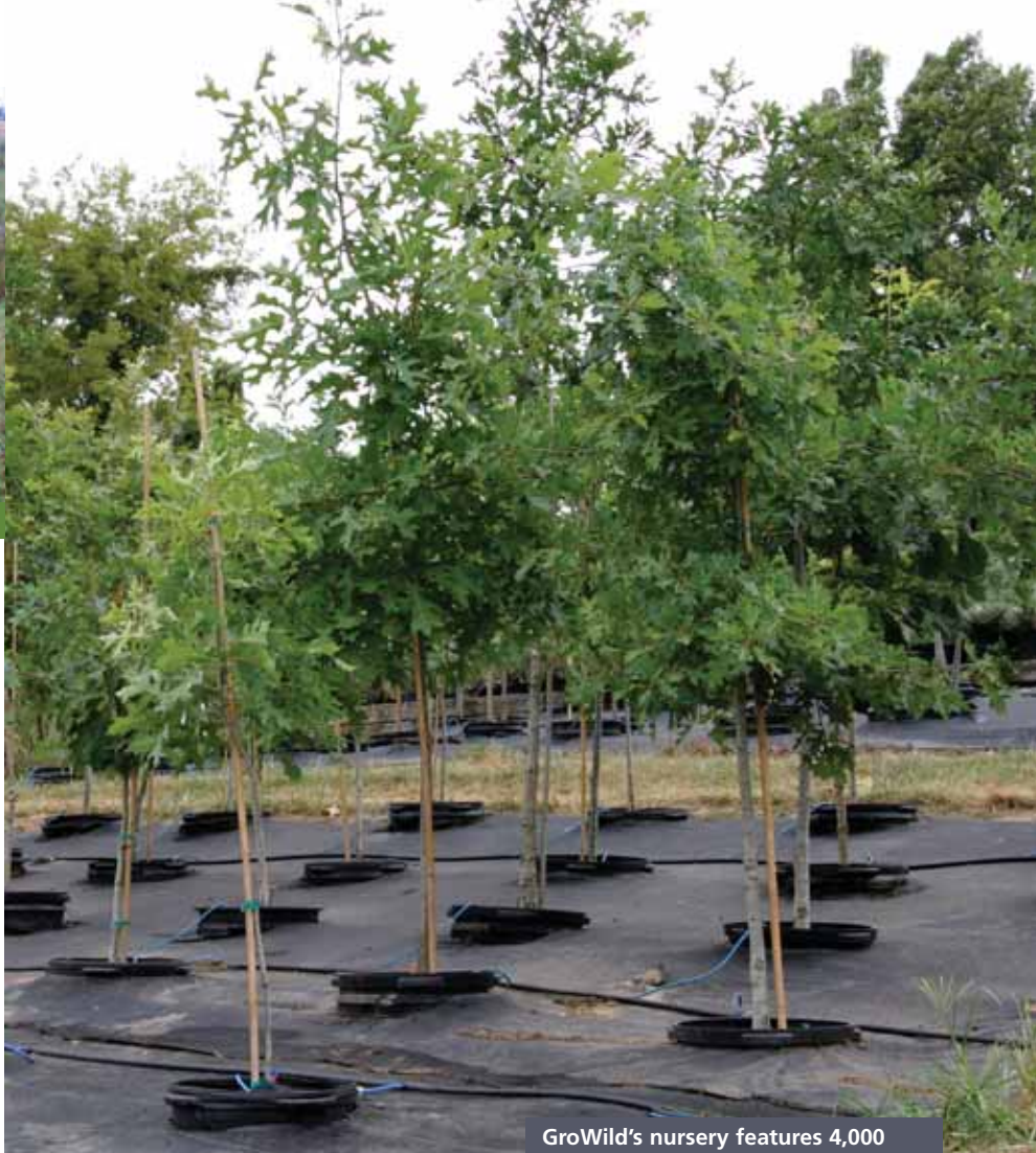
GroWild's nursery features 4,000 trees growing on a 7 percent slope.