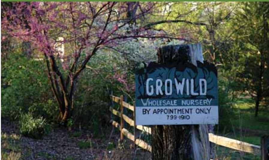
GroWild's logo sports an appropriately easy-going, rough-around-the-edges style.