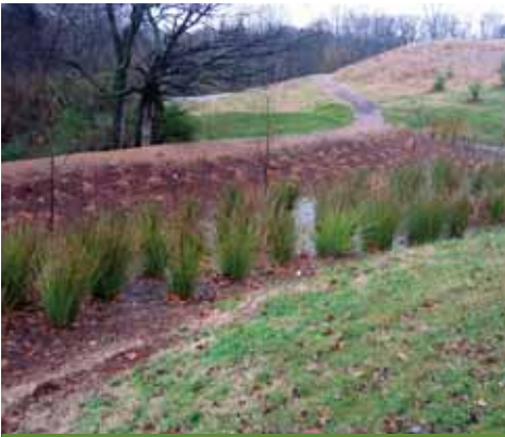
The rolling terrain on GroWild's 120 acres

American native plants and trees other than dogwoods and redbuds.”