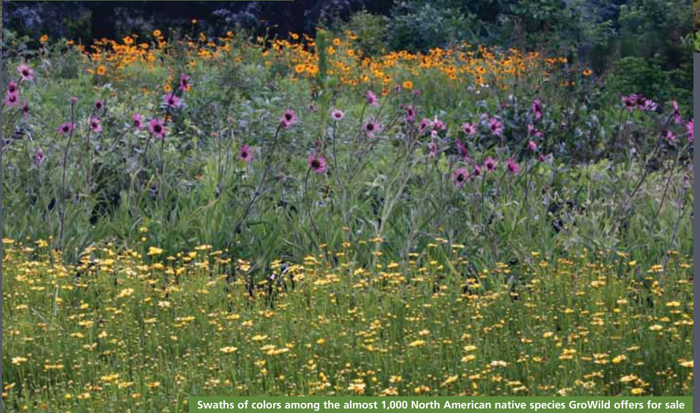
Swaths of colors among the almost 1,000 North American native species GroWild offers for sale