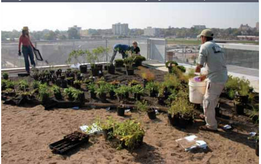
GroWild's new green roof mix is 75 percent mineral-based and 25 percent organic matter.

rely on durable plants that can handle a range of tough conditions.