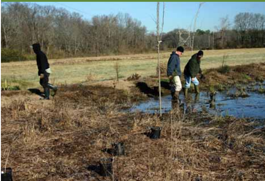
GroWild also specializes in riparian restoration and counts the US Army Corps of Engineers among its best customers.

get better drainage. A lot of these plants don't like to be in these black, plastic pots, so you either change the container, which can be problematic, or you change the soil mix to get better drainage," he notes.