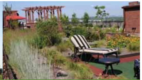
The Nashville condominium green roof project that earned GroWild a reputation in the green design industry and got the ball rolling for other green roof projects

Berkley and his wife literally handled all of the plants they grew, but today, the company employs 12 full-time workers during the peak season and six during the off-season just to keep up.