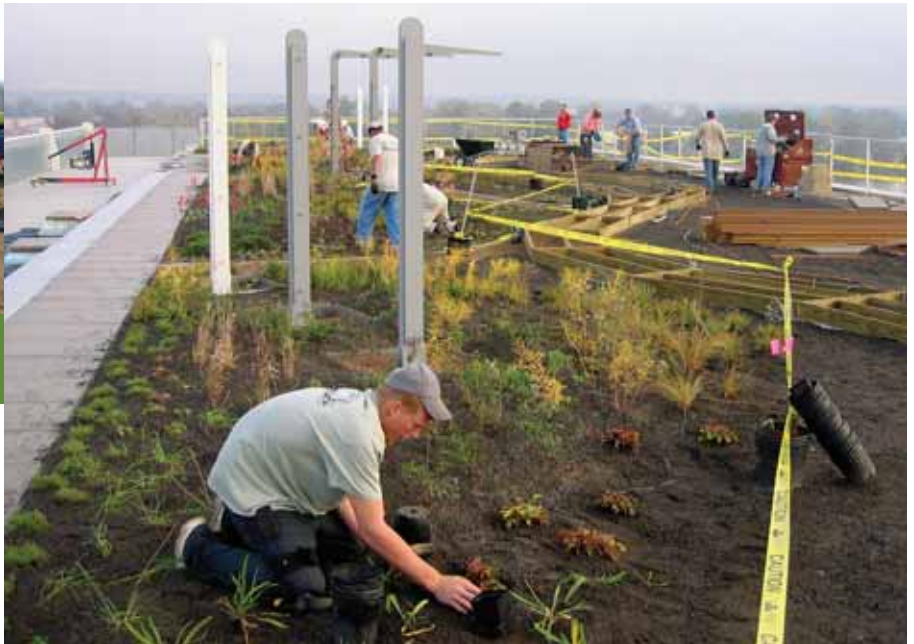
The green roof on the Clinton Presidential Library begins to take shape.