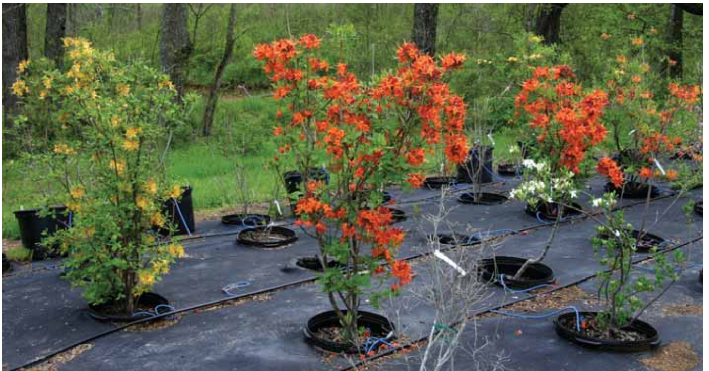
The robust growth and blooms sometimes pleasantly surprise Berkley when new natives are produced in cultivation.