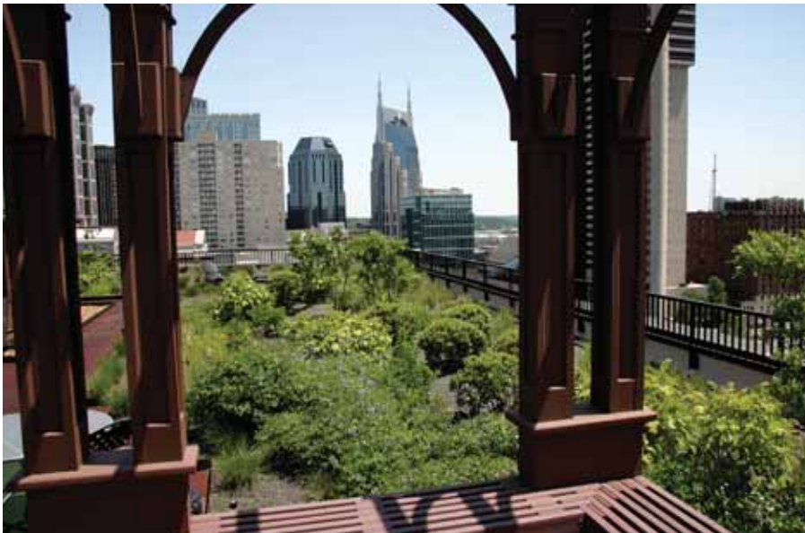
The Nashville condominium green roof after completion