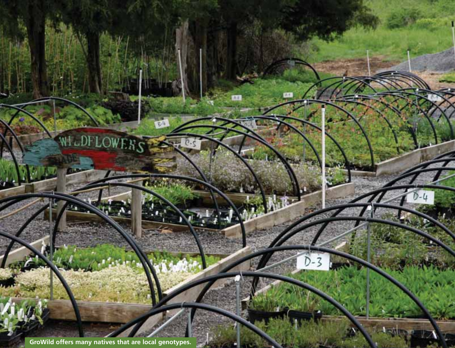
GroWild offers many natives that are local genotypes.