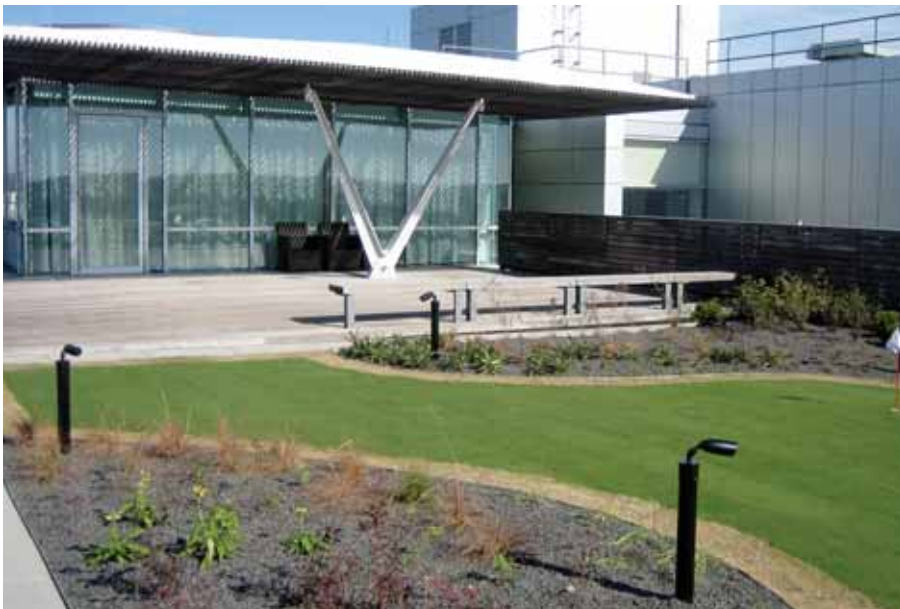
The south roof of the Clinton Presidential Library shortly after installation